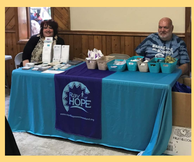
JPO Family FunFest