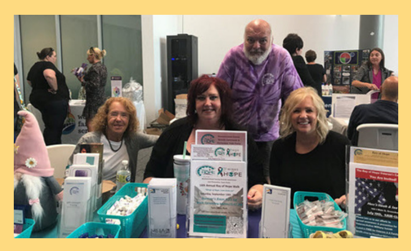
Westmoreland County Human Services Resource Fair