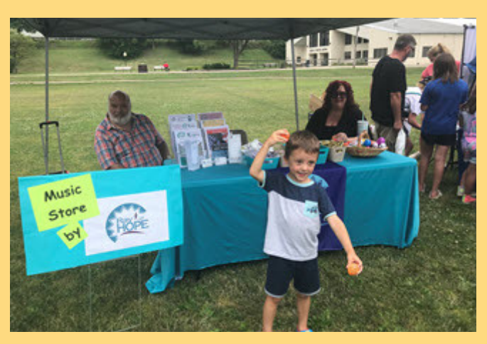
ParentWISE Family Funday Sundae