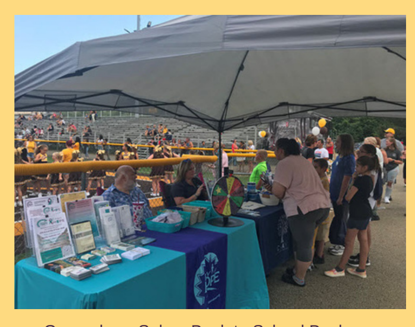
Greensburg Salem Back to School Bash